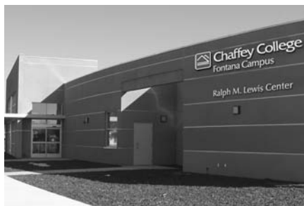
CHAFFEY COLLEGE FONTANA CAMPUS 16855 Merrill Avenue, Fontana

The Robert Pile Information Technology Center was developed in partnership with the City of Chino Redevelopment Agency and industry partners Verizon, Enterasys, Cisco, and Gateway to provide Southern California the state-of-the-art training and education vital for its economic growth. The center is designed to meet the needs of the information technology industry by providing a well-trained and educated workforce. Classes offered include web development, hardware repair, networking, Cisco academies (CCNA, CCNP), and industrial electrical technology. For additional information call (909) 652-8000.