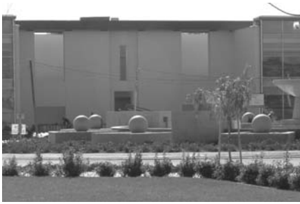
CHAFFEY COLLEGE CHINO CAMPUS College Park 5897 College Park Avenue, Chino

The Chaffey College Chino Campus includes five buildings: three of which are at the College Park location and two buildings are at the downtown Chino location. The campus provides a full array of student services including admissions, cashiering, financial aid, academic counseling, and a full service bookstore. Students have access to two Student Success Centers – one a discipline specific Reading/Writing Center and the other a multidisciplinary center serving students in a variety of subjects. Students are offered instruction in a multitude of general education and occupational courses. Students can complete the following courses uniquely at the Chino Campus: Vocational Nursing, Industrial Electrical Technology, CISCO, Hotel and Food Service Management, and Fashion Design/Fashion Merchandising. For additional information, call (909) 652-8000.