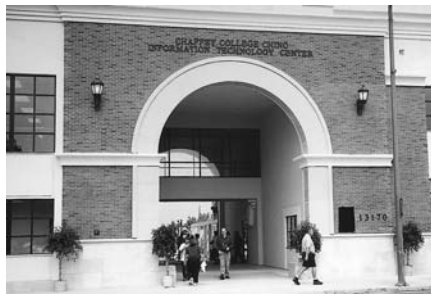
ROBERT PILE INFORMATION TECHNOLOGY CENTER 13170 Seventh Street, Chino

The Educational Center opened its doors in Spring 2000 to better serve the residents of the southwestern portion of the district. The Center hosts Chaffey College's Economic and Workforce Development Office which offers short-term, intensive vocational training reflective of current business and industry needs. The Economic and Workforce Development Office also provides a myriad of services to local business and industry to enhance performance in the workplace including: needs assessment, performance consultation, business solutions, and development of customized training to address identified needs.