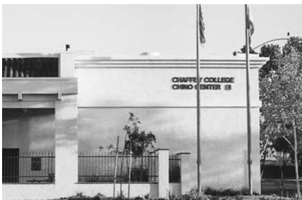
EDUCATIONAL CENTER 13106 Central Avenue, Chino

The Chaffey College Chino Campus includes five buildings: three of which are at the College Park location and two buildings are at the downtown Chino location. The campus provides a full array of student services including admissions, cashiering, financial aid, academic counseling, and a full service bookstore. Students have access to two Student Success Centers – one a discipline specific Reading/Writing Center and the other a multidisciplinary center serving students in a variety of subjects. Students are offered instruction in a multitude of general education and occupational courses. Students can complete the following courses uniquely at the Chino Campus: Vocational Nursing, Industrial Electrical Technology, CISCO, Hotel and Food Service Management, and Fashion Design/Fashion Merchandising. For additional information, call (909) 652-8000.