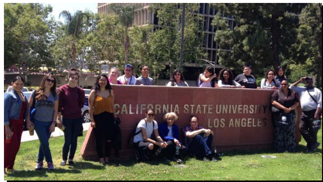
During this trip to CSU Los Angeles in April 2017 students were given a tour of the CSULA campus and an opportunity to speak with transfer mentors.