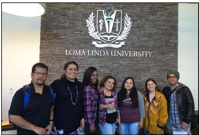
During this trip to Loma Linda University in March 2017, students learned a great deal about many health-science programs and took a campus tour.

The Association of Independent California Colleges and Universities The Association of Independent California Colleges and Universities (AICCU) represents almost 80 California private nonprofit colleges and universities. Visit www.aiccu.edu to research member colleges and access a college planning guide for high school students.