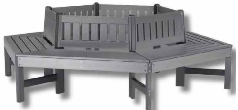
4 tree hugging benches Color: Brown

For everyone: Serves students, staff, and visitors.