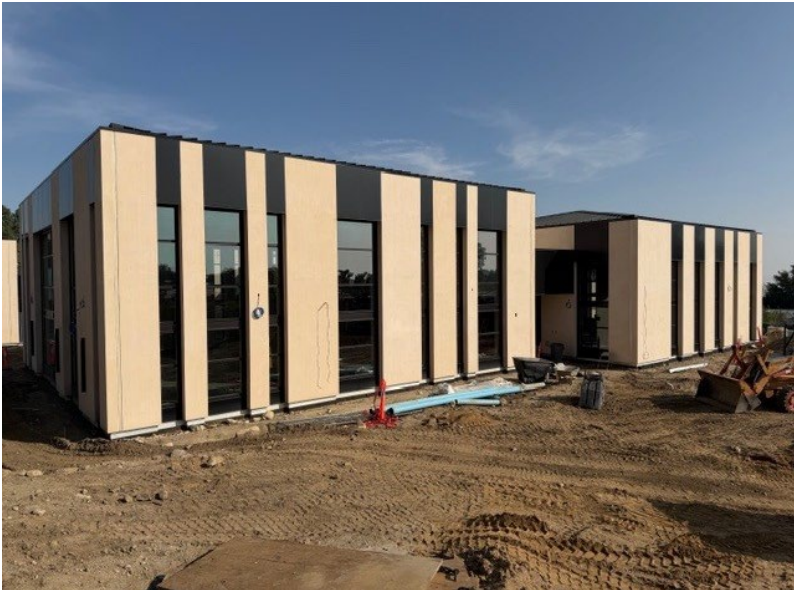
RANCHO CUCAMONGA MACC RENOVATION & ADDITION In Construction