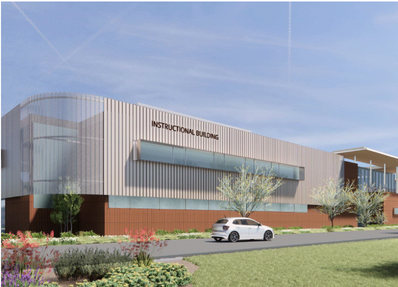
NEW ONTARIO CAMPUS INSTRUCTIONAL BUILDING Criteria Document Review