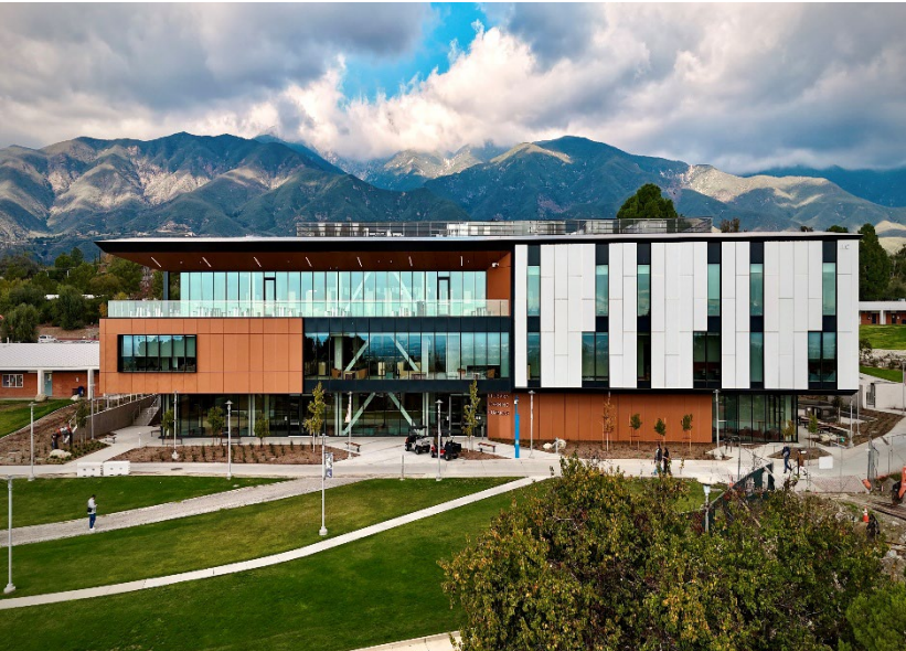
RANCHO CUCAMONGA LLC (LIBRARY LEARNING COMMONS) Completed