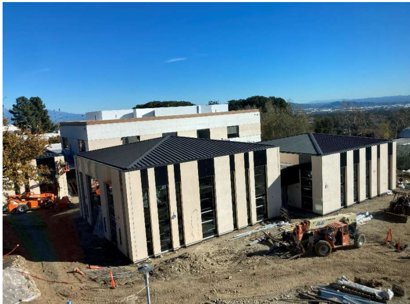
RANCHO CUCAMONGA MACC RENOVATION & ADDITION In Construction