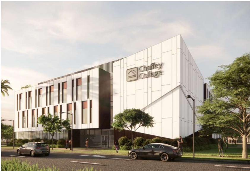
NEW FONTANA CAMPUS PH 1 WELCOME CENTER LIBRARY In Design