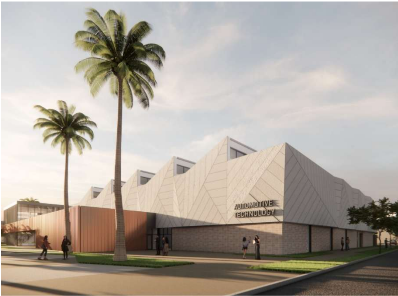
NEW FONTANA CAMPUS PH 1 Automotive Tech Lab In Design