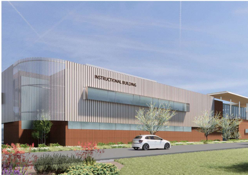
NEW ONTARIO CAMPUS INSTRUCTIONAL BUILDING Criteria Document Review