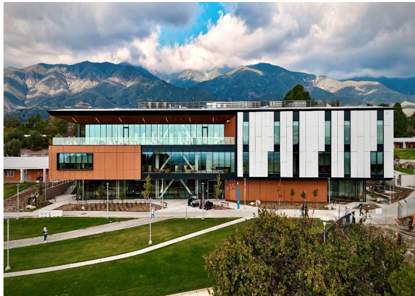
RANCHO CUCAMONGA LLC (LIBRARY LEARNING COMMONS) Completed