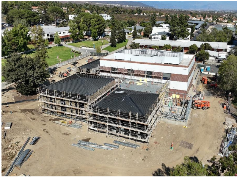
RANCHO CUCAMONGA MACC RENOVATION & ADDITION In Construction