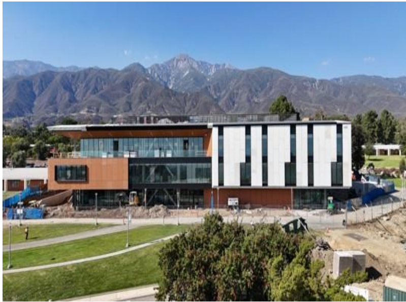
RANCHO CUCAMONGA LLC (LIBRARY LEARNING COMMONS) Near Completion