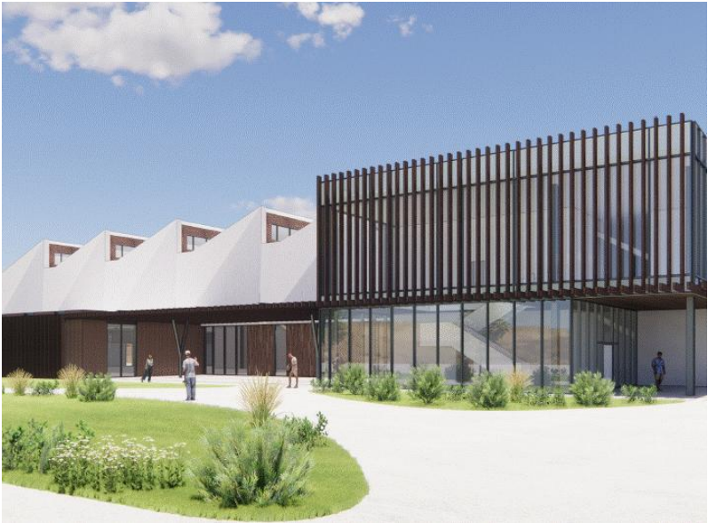
NEW FONTANA CAMPUS PH 1 – AUTOMOTIVE TECH LAB In Design