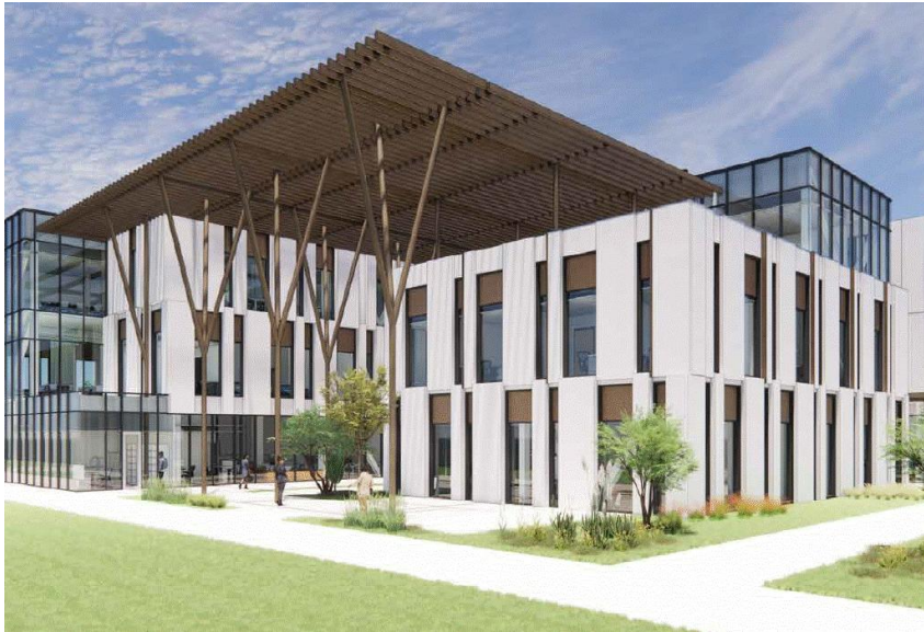
NEW FONTANA CAMPUS PH 1 - Welcome Center Library In Design