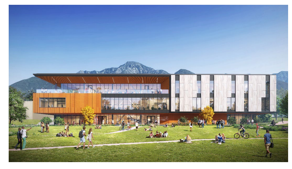
RANCHO CUCAMONGA Pool Renovation (South West Elevation)