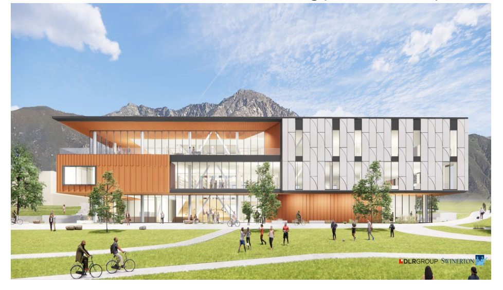
RANCHO CUCAMONGA Pool Renovation (South East Elevation)