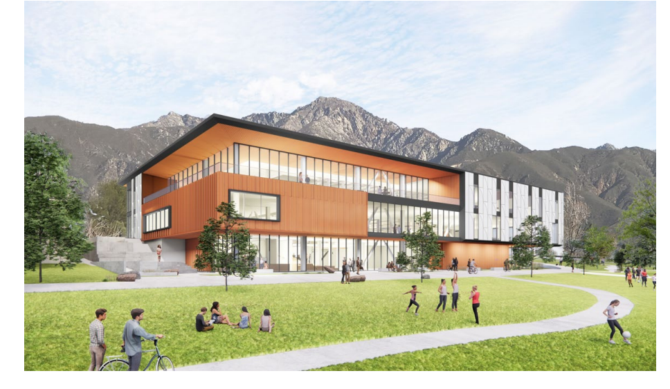
RANCHO CUCAMONGA Pool Renovation (South West Elevation)