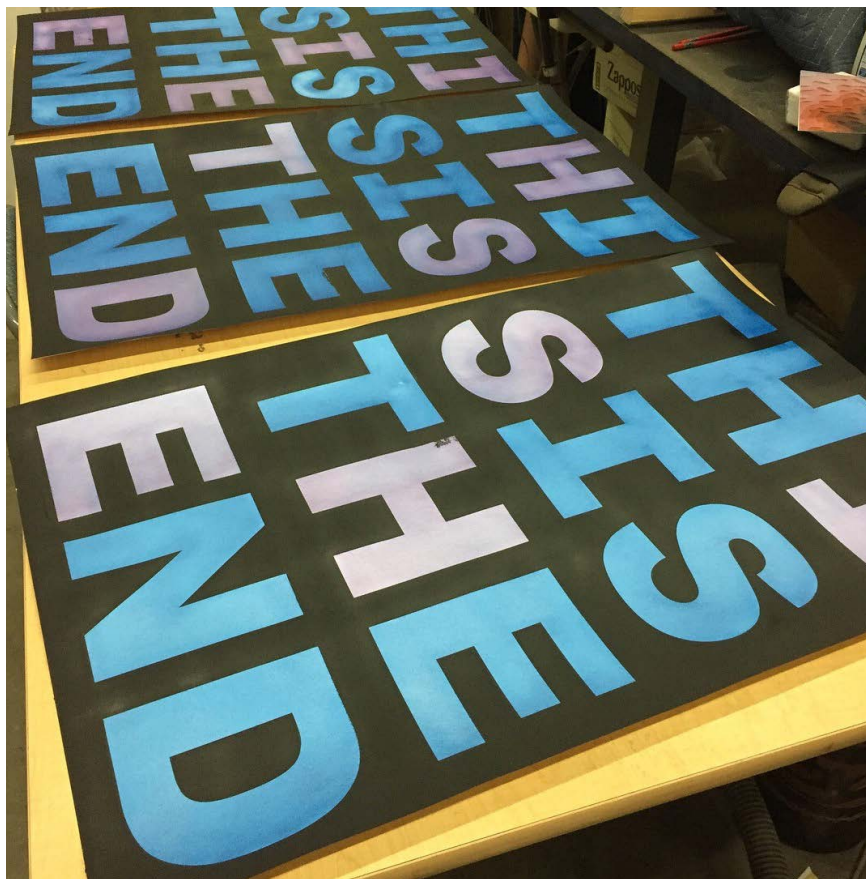
Macha Suzuki, Rainbow Apocalypse , 2015, acrylic and spray paint on paper, 36 x 24 inches each.