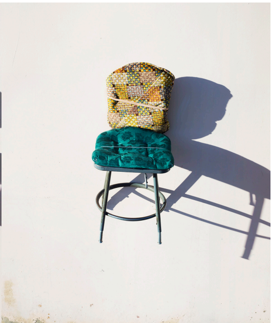
Anthony Lepore, Factory Chair 10 , 2015, archival pigment print, 38 x 22 inches.