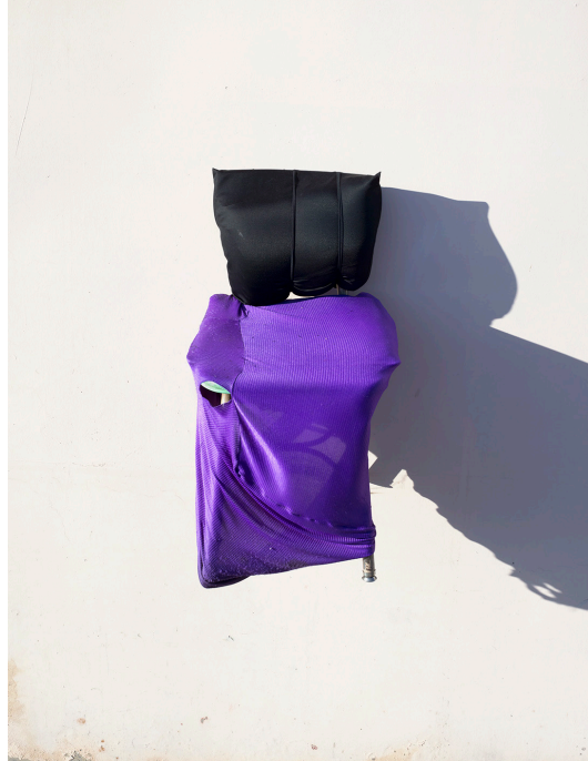
Anthony Lepore, Factory Chair 2 , 2015, archival pigment print, 38 x 22 inches.