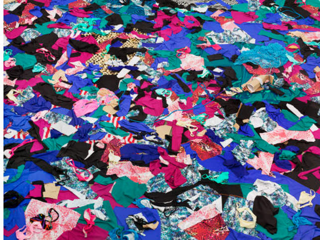
Anthony Lepore, Floor Sample , 2015, archival pigment print, 40 x 52 inches.

The artists and artworks included in Fashion-Conscious engage with issues and concerns surrounding our understanding of fashion. Fashion-Conscious presents a selection of work that will hopefully make visitors to the exhibition more conscious about their relationship to fashion and prompt them to consider how fashion can change to be more conscious.