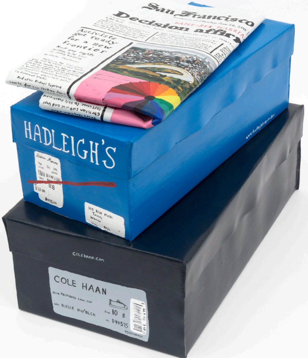
Libby Black, Marriage , 2015, paper, hot glue and acrylic paint, 10 x 14 x 7 inches. Courtesy of the artist.