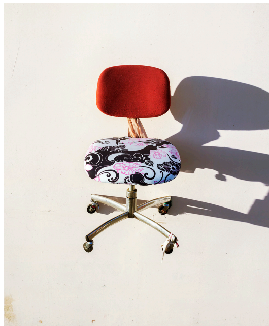
Anthony Lepore, Factory Chair 5 , 2015, archival pigment print, 38 x 22 inches.