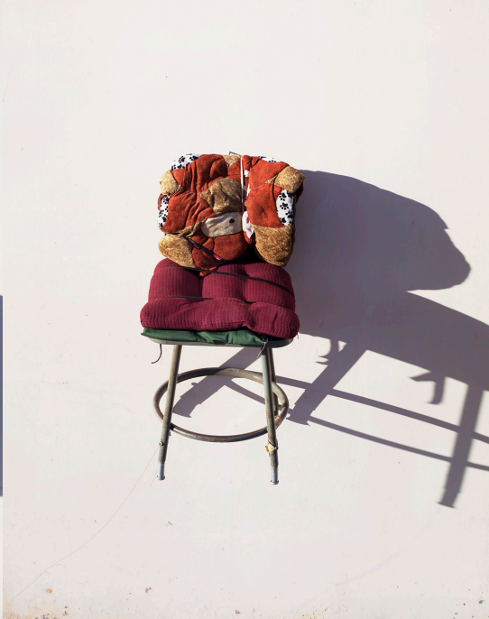
Anthony Lepore, Factory Chair 4 , 2015, archival pigment print, 38 x 22 inches.