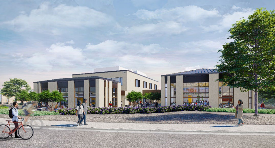
RANCHO CUCAMONGA MACC Renovation & Addition