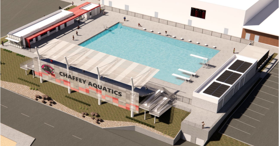
RANCHO CUCAMONGA Pool Renovation (South East Elevation)