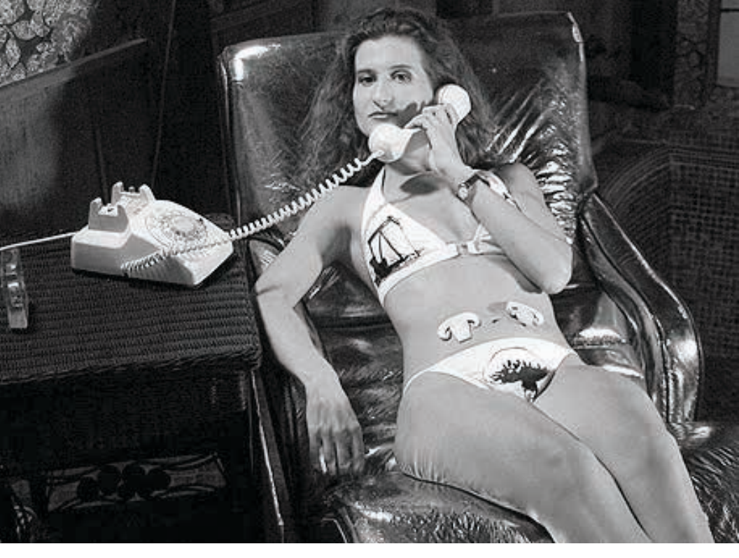
Strange Love (video still), "Miss Scott", LA Art Girls/Felis Stella, 2005.