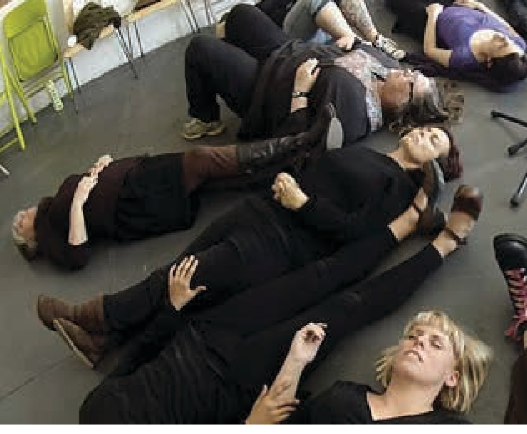
The People's Microphony Camerata performing "Teach yourself to fly" by Pauline Oliveros, Los Angeles, 2012