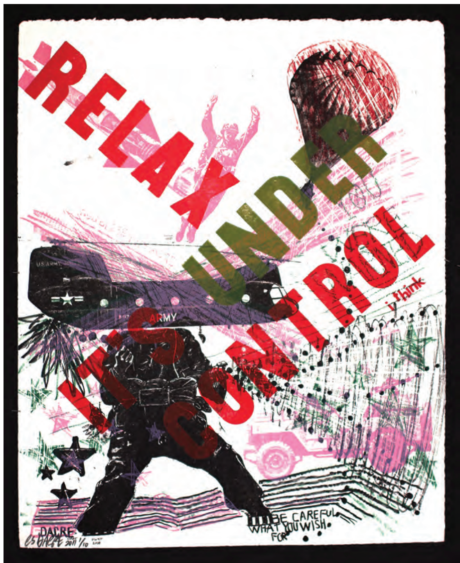
Chris Dacre, from Artificial Dissemination , Relax It's Under Control , 2011/2014, mixed-media: lithograph, relief, collage, wood type and hand coloring, 17 x 13 inches.