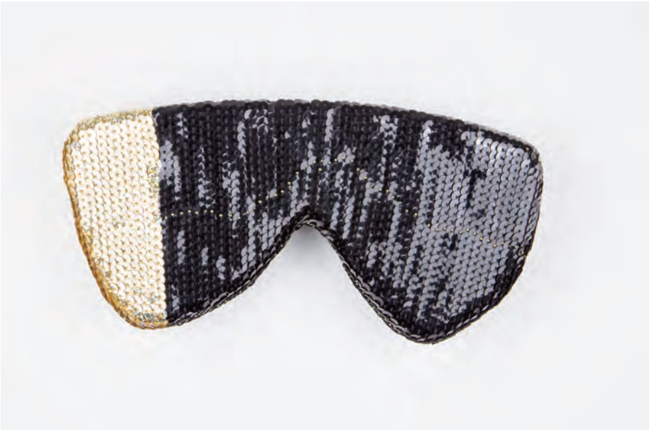
Steven Frost, The Difference Between Men and Boys is the Price of their Toys , 2014, sequins, pins, and pink insulation foam, 8 x 12 x 1 inches.