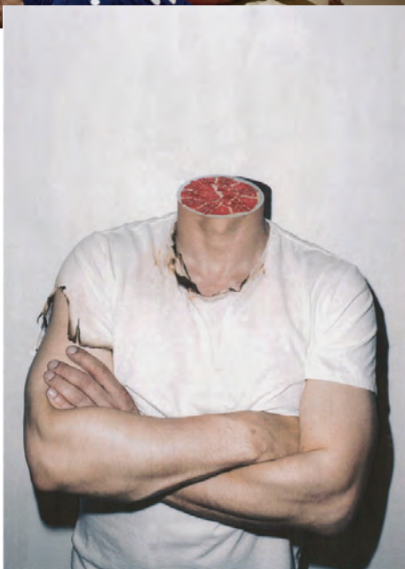
Pilar Gallego, Teen Idol Posters Series (part of I Look at Me Like You're the Ugliest Thing in the World ), Untitled , 2014, inkjet on matte paper, 18 x 24 inches & 18 x 20 inches.