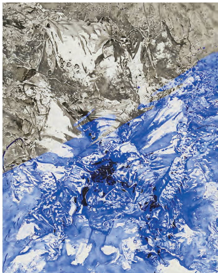
Conrad Ruiz, Tough Lover , 2015, watercolor on canvas, 72 x 60 inches.