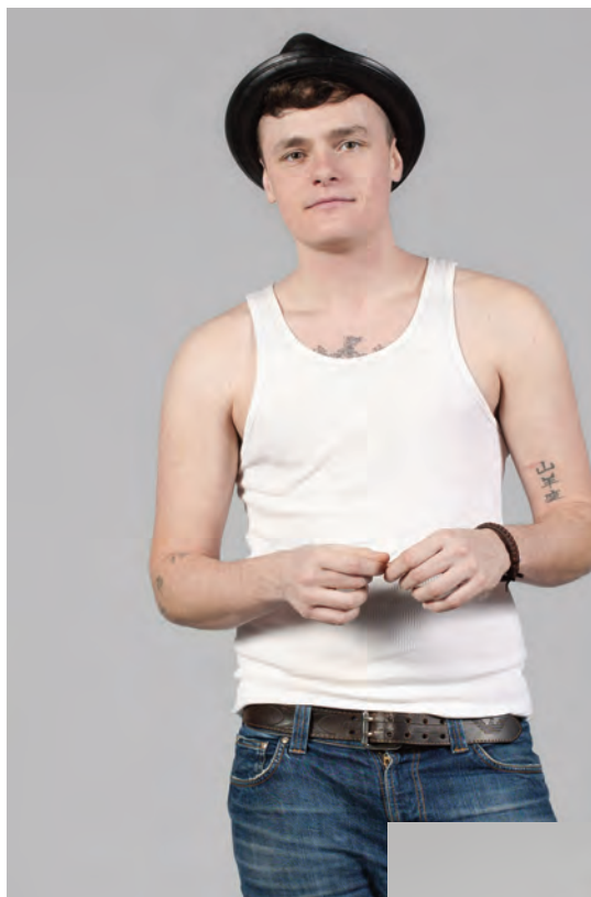
Wynne Neilly, from Of Center, Liam , 2012, c-print mounted on sintra, 24 x 18 inches.