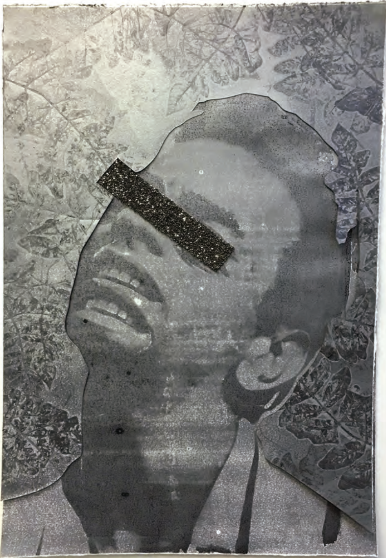
Devan Shimoyama, Idol Eclipsed (Johnny) , 2016, monotype print with collage and glitter, 36 x 25 inches.