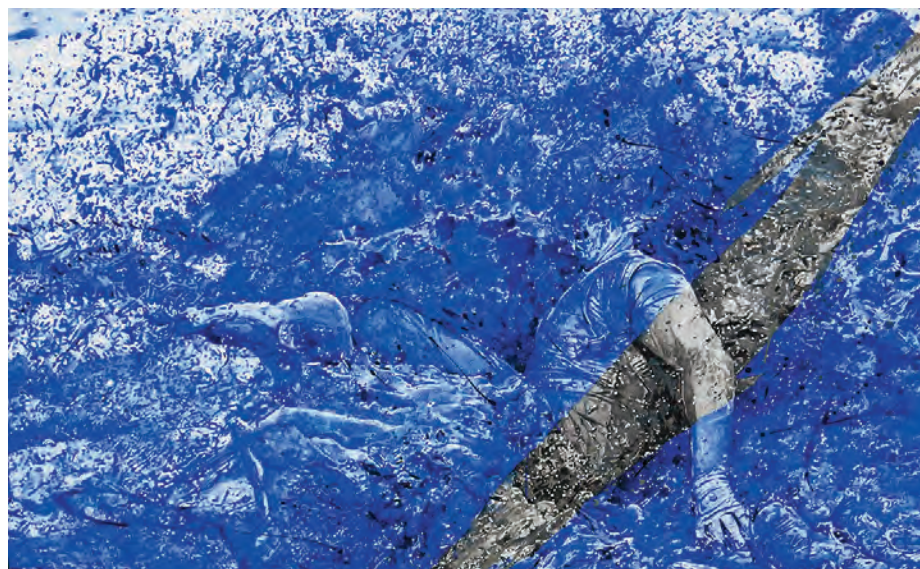
Conrad Ruiz, Bomb Slide II , 2015, watercolor on canvas, 37 x 60 inches.