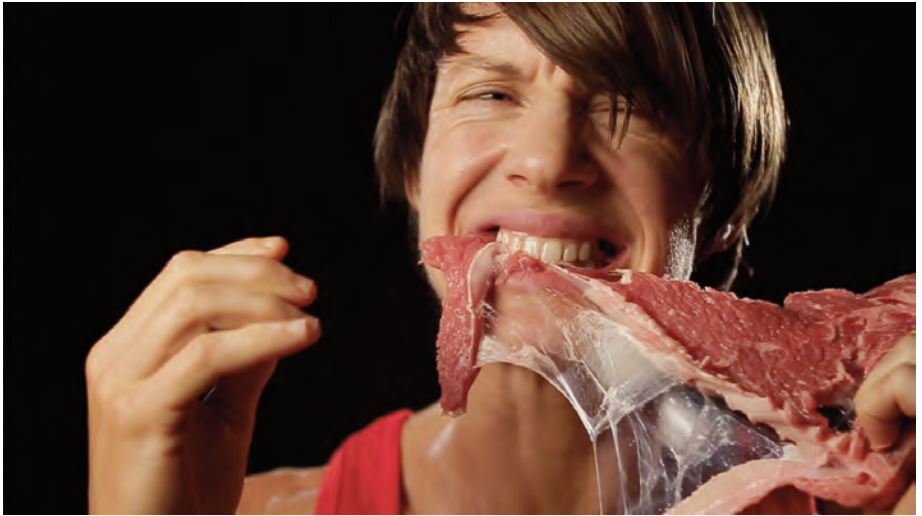
Cassils, still from Fast Twitch//Slow Twitch , 2011, two channel video installation, TRT 11:08.