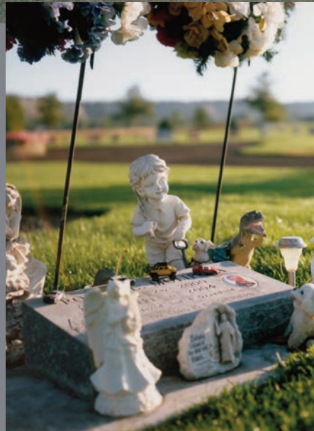
Kristen S. Wilkins, Untitled #10 from the Supplication series, 2009–2014, inkjet prints, 8 x 10 inches and 4 x 6 inches, and text. Grand Ave. by Shiloh (Cemetery). Left side of water fountain. Has colorful wreath with flowers. It is were my son is @. He is the best thing that happened to me in my life. He was my world.