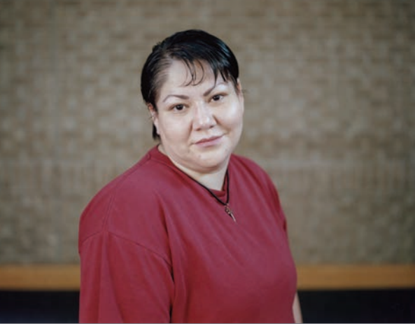
Kristen S. Wilkins, Untitled #10 from the Supplication series, 2009–2014, inkjet prints, 8 x 10 inches and 4 x 6 inches, and text. Courtesy of the artist. Grand Ave. by Shiloh (Cemetery). Left side of water fountain. Has colorful wreath with flowers. It is were my son is @. He is the best thing that happened to me in my life. He was my 'world.'

Recently, President Obama gave a speech to the NAACP at their annual convention in Philadelphia, pointedly calling for greater reforms in the criminal justice system . With the September 2014 passage of Senate Bill 1391, which requires the Department of Corrections and Rehabilitation and the Office of the Chancellor of the California Community Colleges to enter into an interagency agreement to expand access to community college courses that lead to degrees or certificates that result in enhanced workforce skills or transfer to a four-year university . Educational programs within prisons are proving successful and benefiting communities while