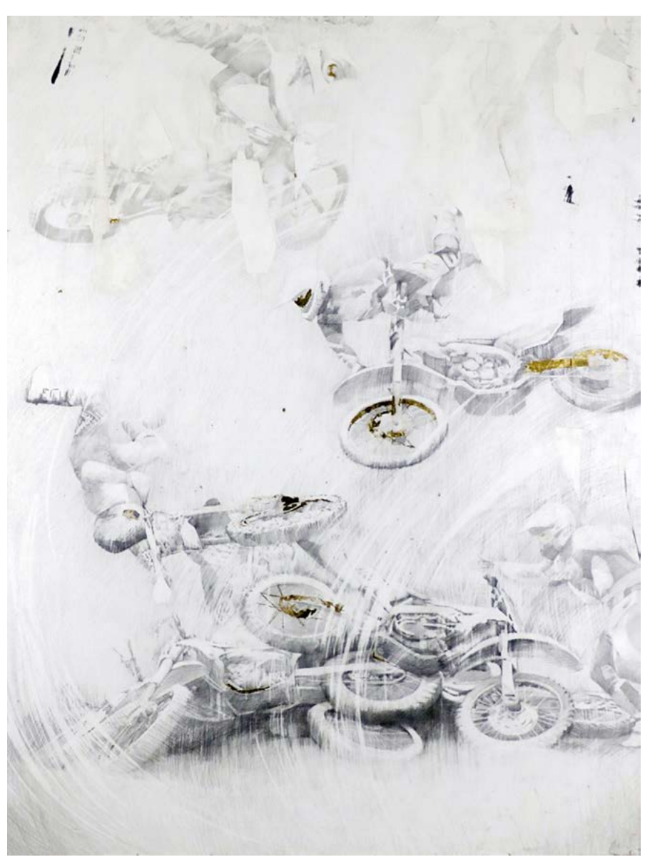
Rachel Wolfson Smith, Newton's Law, 2016, graphite and gold leaf on paper, 72 x 54 inches.

My large-scale graphite drawings give a nod to dramatic Renaissance battle paintings. Dirt bike riders are like soldiers on horseback, hidden behind helmets and racing costumes that playfully mask the tragedy of the crashes they're paused in. Myths, contradictions, and ridiculous driving machinery fuel drawings that illustrate the guarantee that what goes up must inevitably come down.