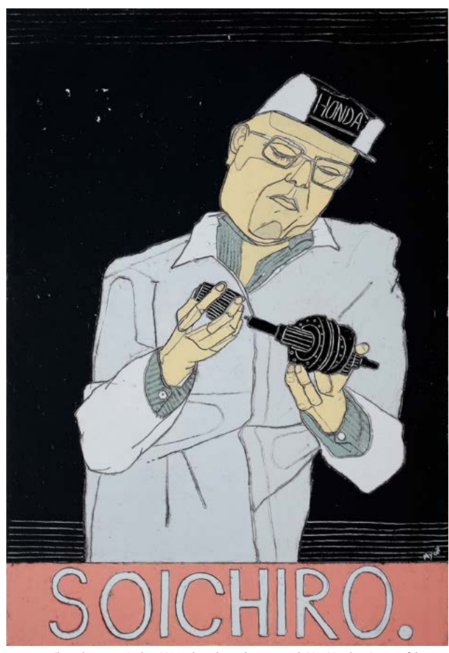
Christopher Myott, Soichiro, 2016, oil, graphite and wax on panel, 30 x 20 inches.

Much of my work lies somewhere at the intersection of drawing and painting. I use pallet knives and handmade implements to manipulate oil paint on panel, and then I draw through the surface of the paint often exposing layers of color underneath. The process offers an unedited spontaneity akin to handwriting and investigates the relationship between the deliberate and the inadvertent. I often create interior spaces around the subject that tends to flatten the image and warp the perspective in interesting ways. I use finishing techniques I learned as a furniture maker to highlight textural elements. The goal is to make a physical object only fully appreciated in person.