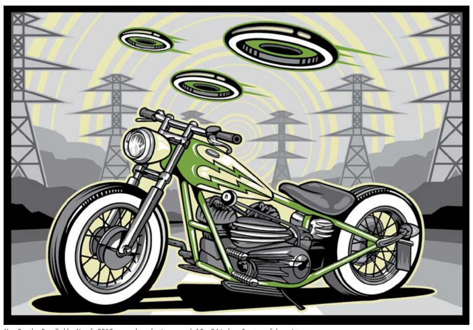
Max Grundy, Patrolled by Aircraft, 2012, enamel on aluminum panel, 18 x 24 inches. Courtesy of the artist.

My painting is created with enamel paint on aluminum panel, a nod to the automotive and engineering heroes I represent in my work. My compositions contain scenarios that are rendered in a style reminiscent of propaganda art: specifically, Russian World War II propaganda art. I have always admired their use of unusual perspective, a limited color palette, and dramatic text and design for maximum effect.