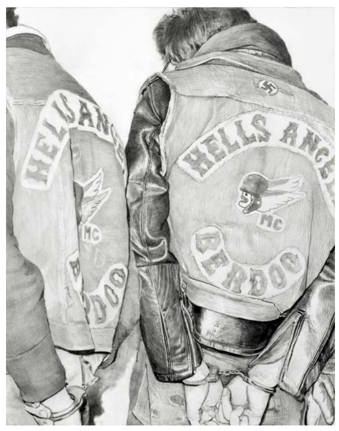
Mark T. Stockton, Hells Angels, 2013, graphite on custom drawing panel, 14 x 10 inches.

My drawings and installations reexamine previously consumed images of famous and infamous archetypes. Dependent on my memory, found images and web searches, my work reflects a collective consciousness that is shaped by our media-saturated culture. Using exaggerated scale and time-consuming detail, I allow viewers to reconsider their relationship to the iconic images I manually record.