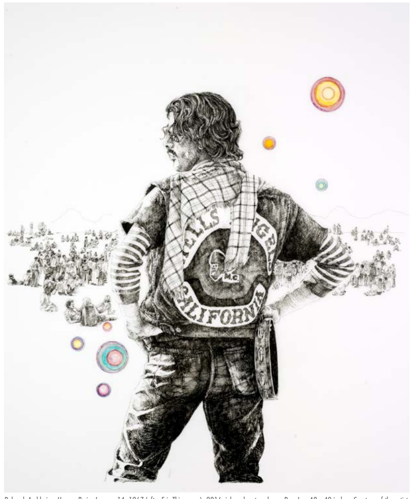
Deborah Aschheim, Human Be-in, January 14, 1967 (after Eric Thiermann), 2016, ink and watercolor on Dura-Lar, 48 x 40 inches. Courtesy of the artist.

The Human Be-in at the Polo Fields in Golden Gate Park was billed as a "Gathering of the Tribes." The free event brought together as many as 30,000 people from diverse communities, including musicians, poets, activists, artists, intellectuals, counterculture luminaries and the "outlaw" motorcycle gangs.