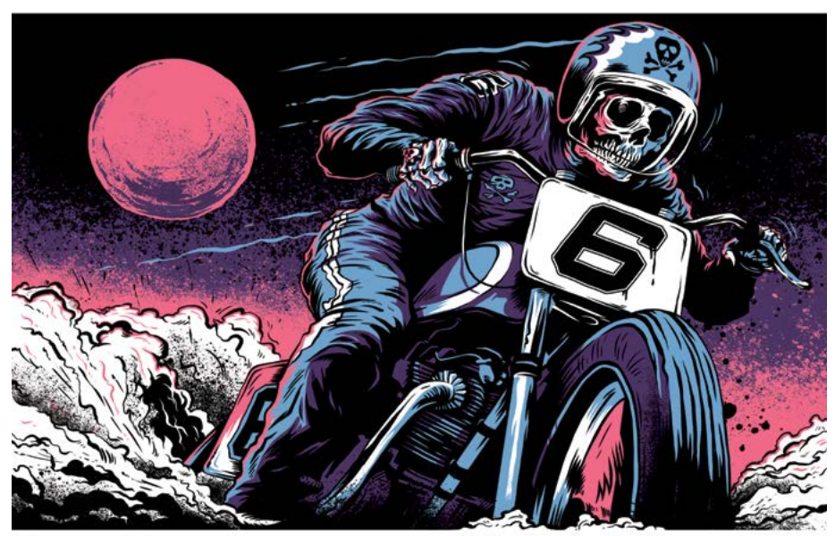
Ryan Quickfall, Midnight Tracker, 2017, 4 color screen print on paper, 50 x 70 cm. Courtesy of the artist.

I am influenced by the outlaw and passionate culture that has for generations established its connections with the motorcycle - the people, the machines and the culture that has built around them. I try to portray the outlaw sense of the motorcycle and its rider, through original and printed media editions. Death and the undead are also prominent themes throughout my works, often portrayed through central, subversive anti-hero characters.