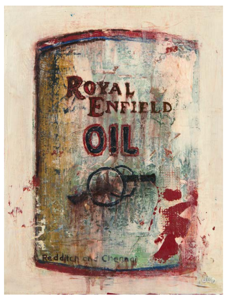
Jeffrey O. Durrant, Royal Enfield Oil, 2017, acrylic on board, 14 x 11 inches.

In recent years, my family and I have settled in Castle Valley, UT and I have been focusing more on my art practice. While my paintings are often quite loose, my subjects are dominated by motorcycle culture – the riders, the tools and materials, and the machines coupled with the rugged landscapes that surround me in my immediate environment in Castle Valley.