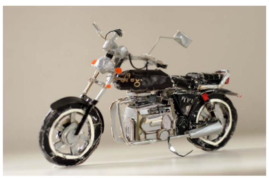
Lydia Ricci, You Need to Wear Pants, 2018, mixed media, 5.5 x 4 x 1 inches.

I have been collecting scraps for over 25 years (top-drawer clutter, dusty office supplies, something hanging out of a neighbor's trash can). I sculpt these scraps into tiny tributes to the objects that are more specific representations of moments in time.