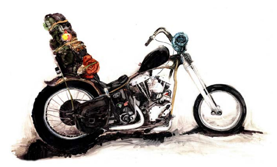
Cory Jarman, Uncle Sam, 2013, ink on paper, 20 x 26 inches.

My illustrations depict motorcycles that I love to look at - nothing more, nothing less. They represent the still life of a machine made to move fast.