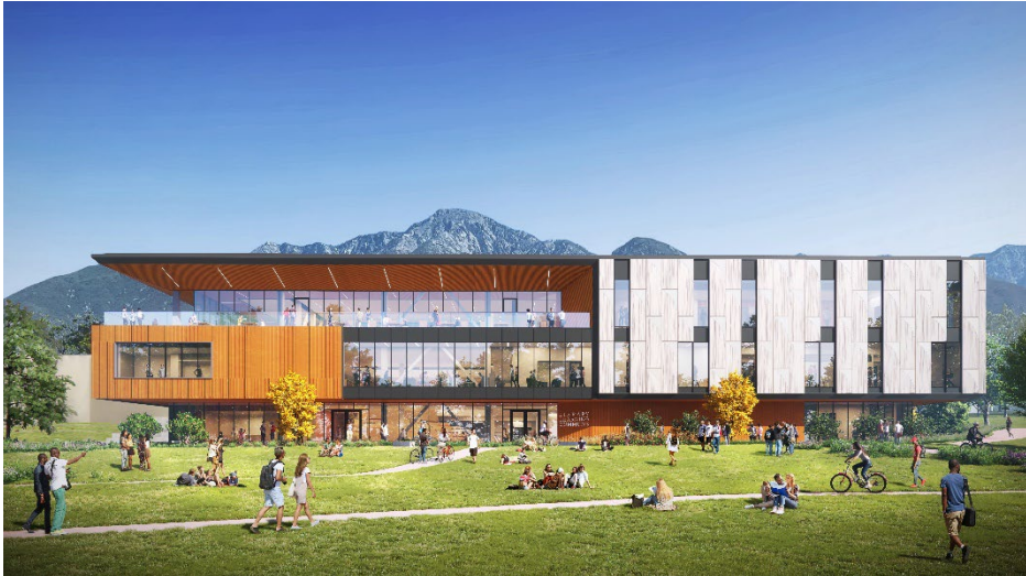
RANCHO CUCAMONGA LLC Rendering (South Elevation)