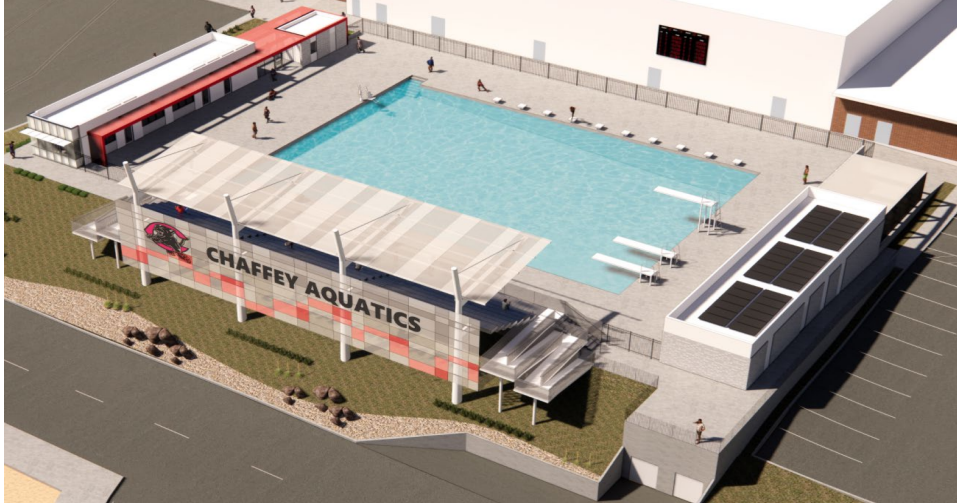
RANCHO CUCAMONGA Pool Renovation (South East Elevation)