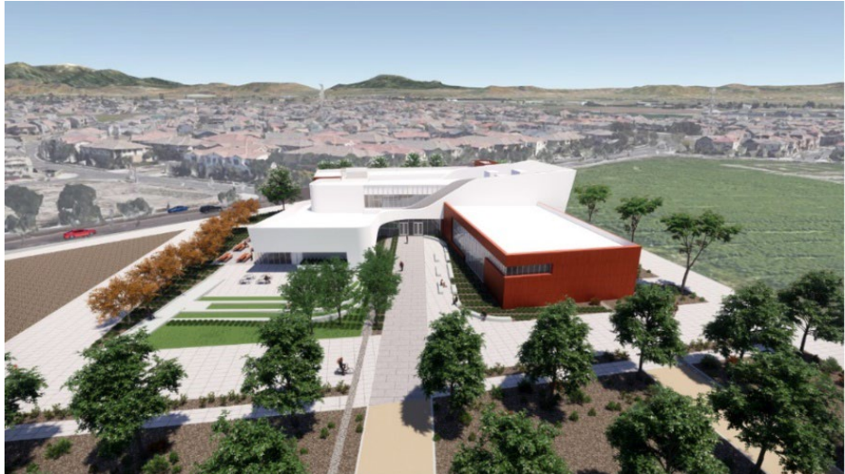
CHINO IB Building View