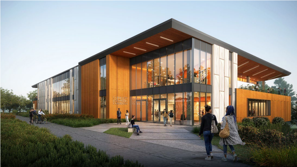
RANCHO CUCAMONGA LLC Rendering (North West Entry)