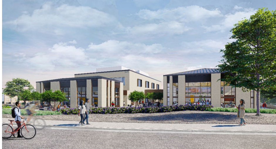
RANCHO CUCAMONGA MACC Renovation & Addition