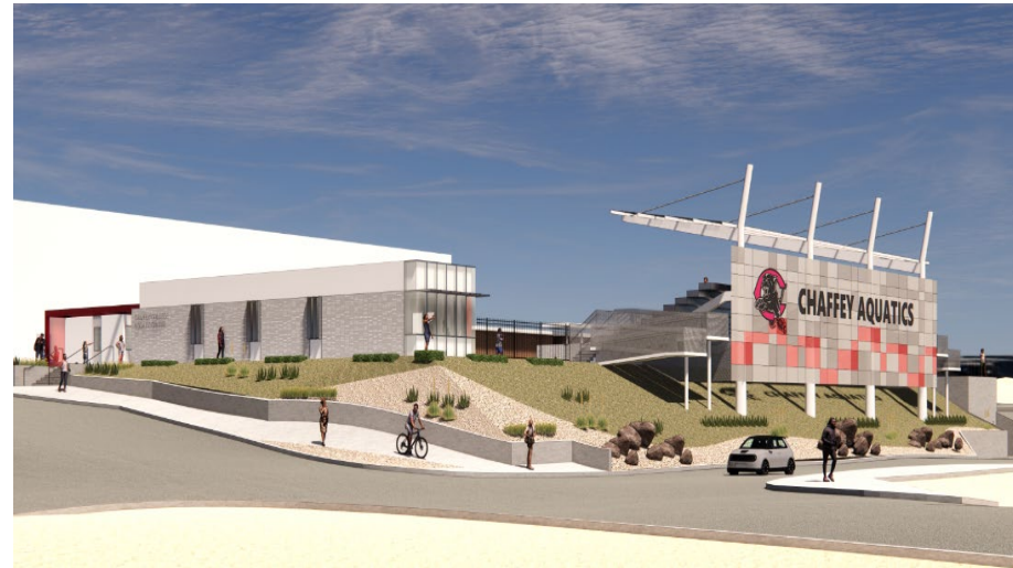
RANCHO CUCAMONGA Pool Renovation (South West Elevation)