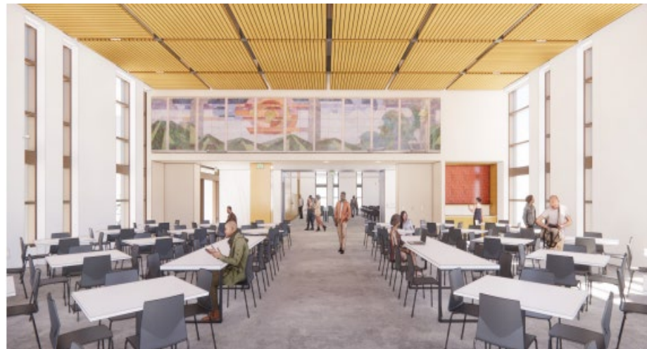
RANCHO CUCAMONGA MACC Renovation & Addition