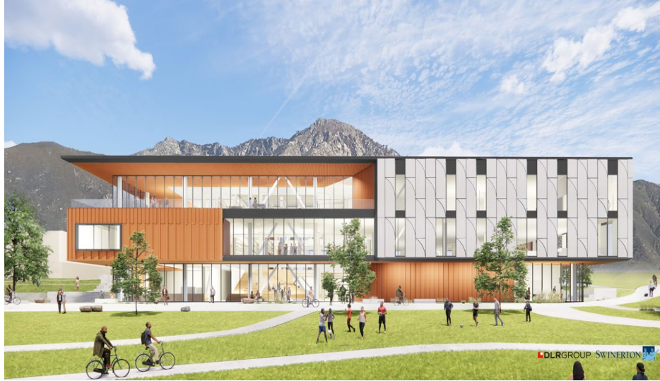
RANCHO CUCAMONGA LLC Rendering (South Elevation)