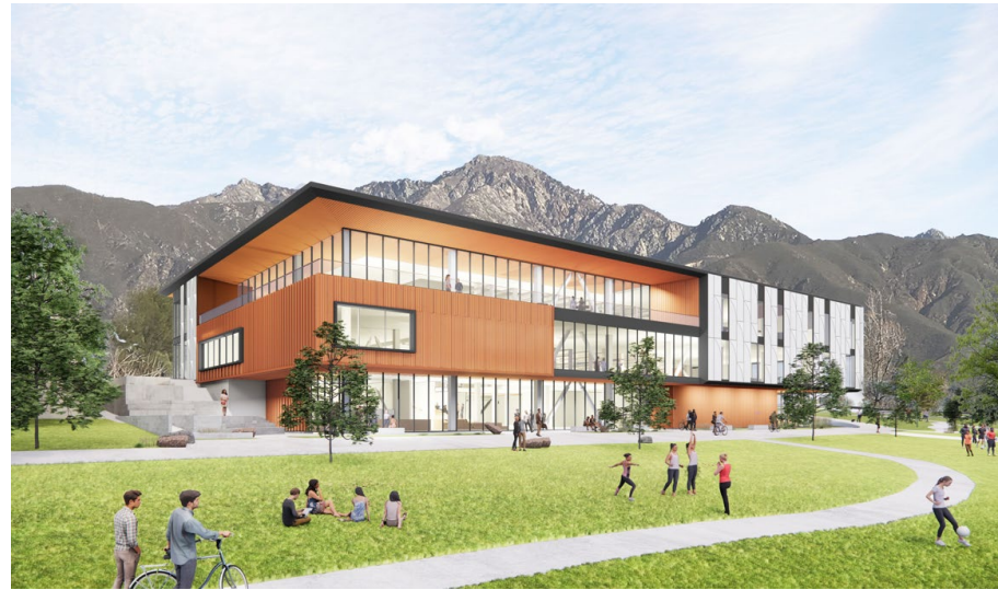
RANCHO CUCAMONGA LLC Rendering (South West Corner Elevation)