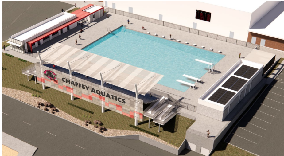
RANCHO CUCAMONGA Pool Renovation (South East Elevation)